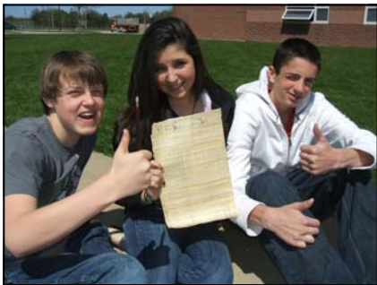
At ERMS, students received scribing kits to help them understand their international peers through stories told by the teens.