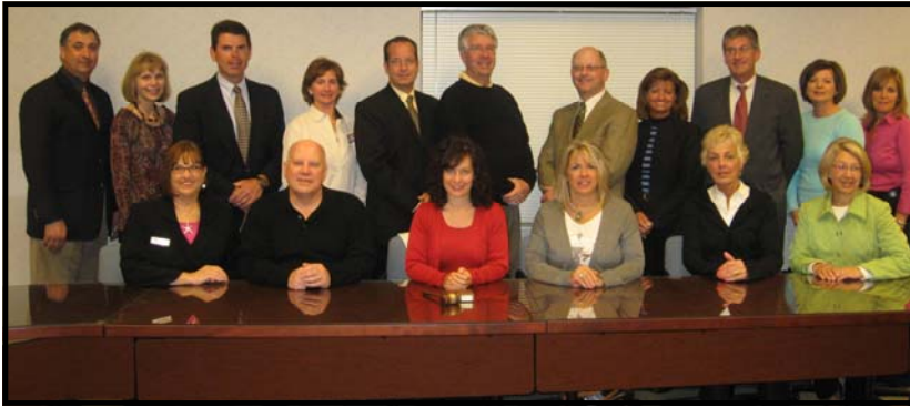
Rockford Education Foundation Board of Trustees

Promoting Excellence in Education Since 1991