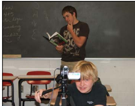
Students in speech class at RHS benefit from new equipment which enables them to record speeches, then take them home to view and analyze their performances.