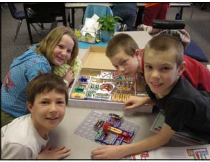
MeadowRidge received a grant for Snap Circuit kits to build electrical and electronic circuits that teach new magnetism and electricity.