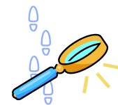
"Word Detectives" uses a language arts decoding lab to create a fun and inviting space for children to learn to use new tools to help them decode words.