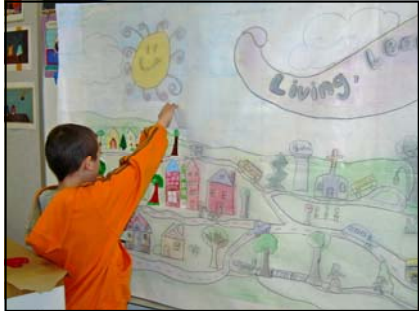
Living, Growing, Learning In Our Community....a grant for students at Parkside to create a mural with hand decorated tiles.