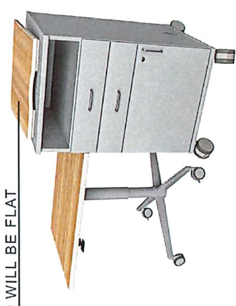
MIEN - 2GTBT MOBILE DESK TABLE: 36"w x 27"d x 29.5" – 44"h CABINET: 24"w x 27"d x 40.4"h